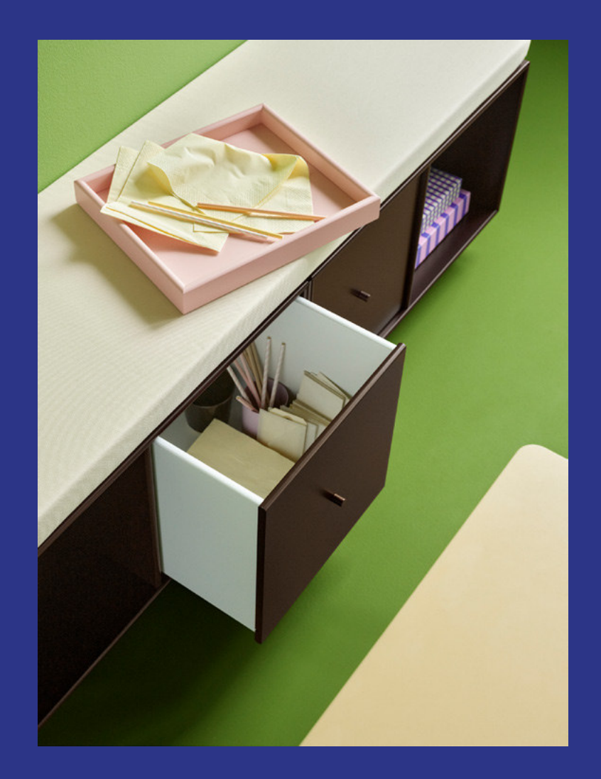
REST III Balsamic with cushion in Reflect 404