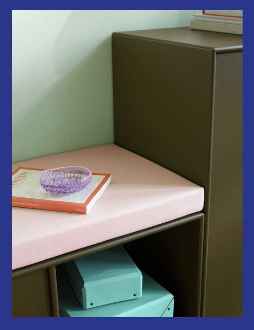
REST I Oregano with cushion in Reflect 614