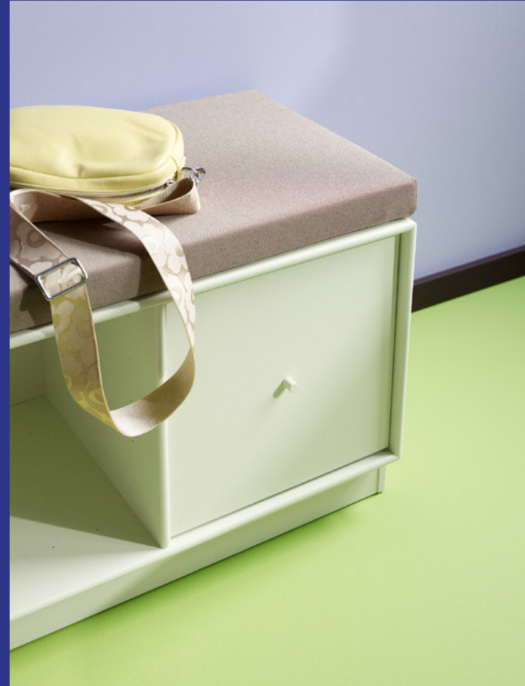
REST II Pomelo with cushion in Reflect 344