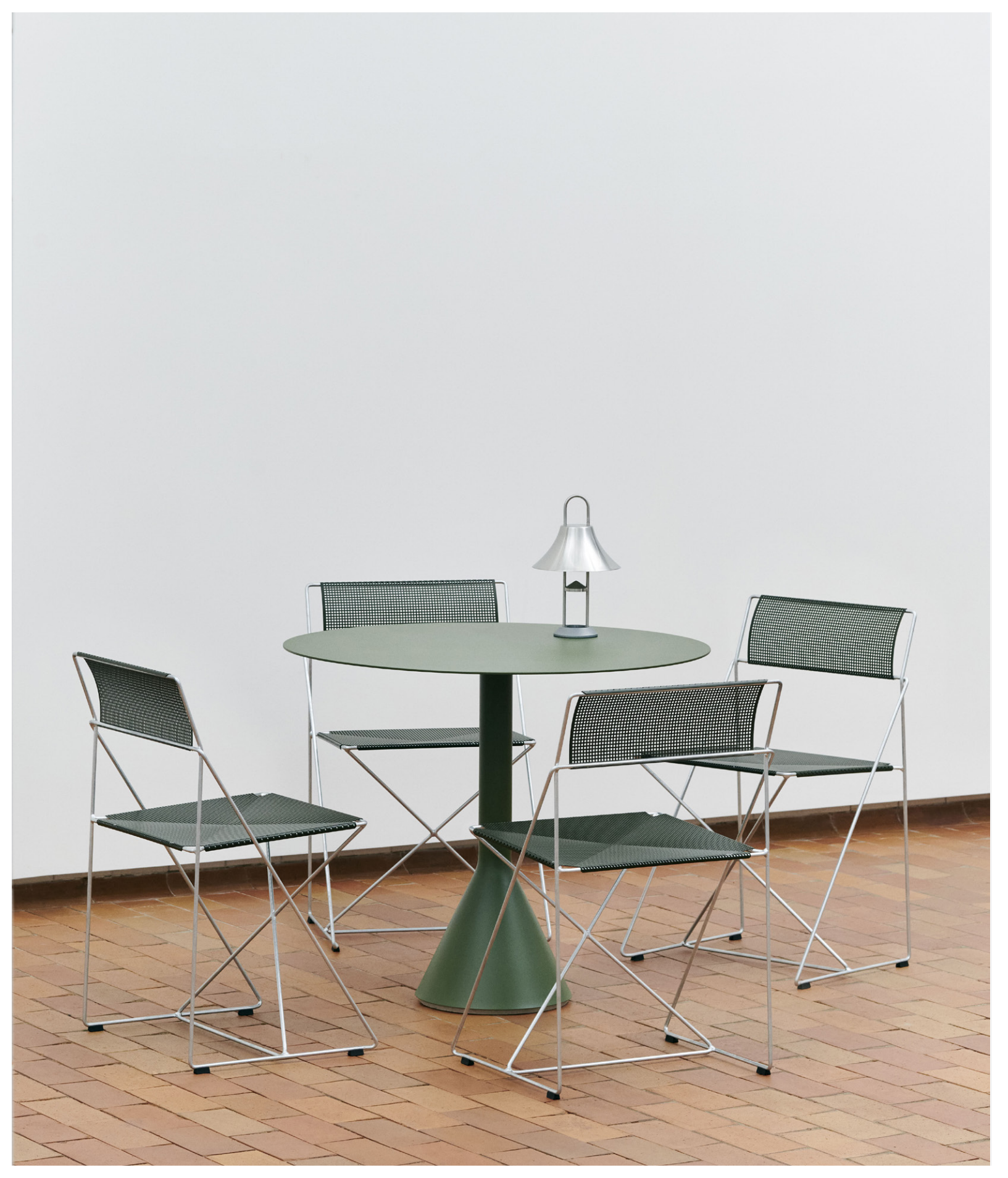
X-Line Chair | Chromed steel frame Indoor