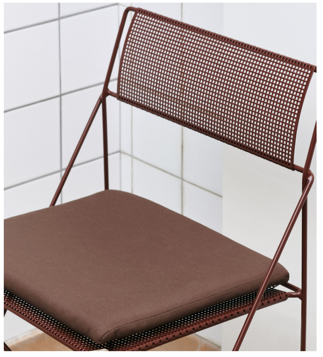
X-Line Chair | Iron red seat & back | Hot galvanised steel frame