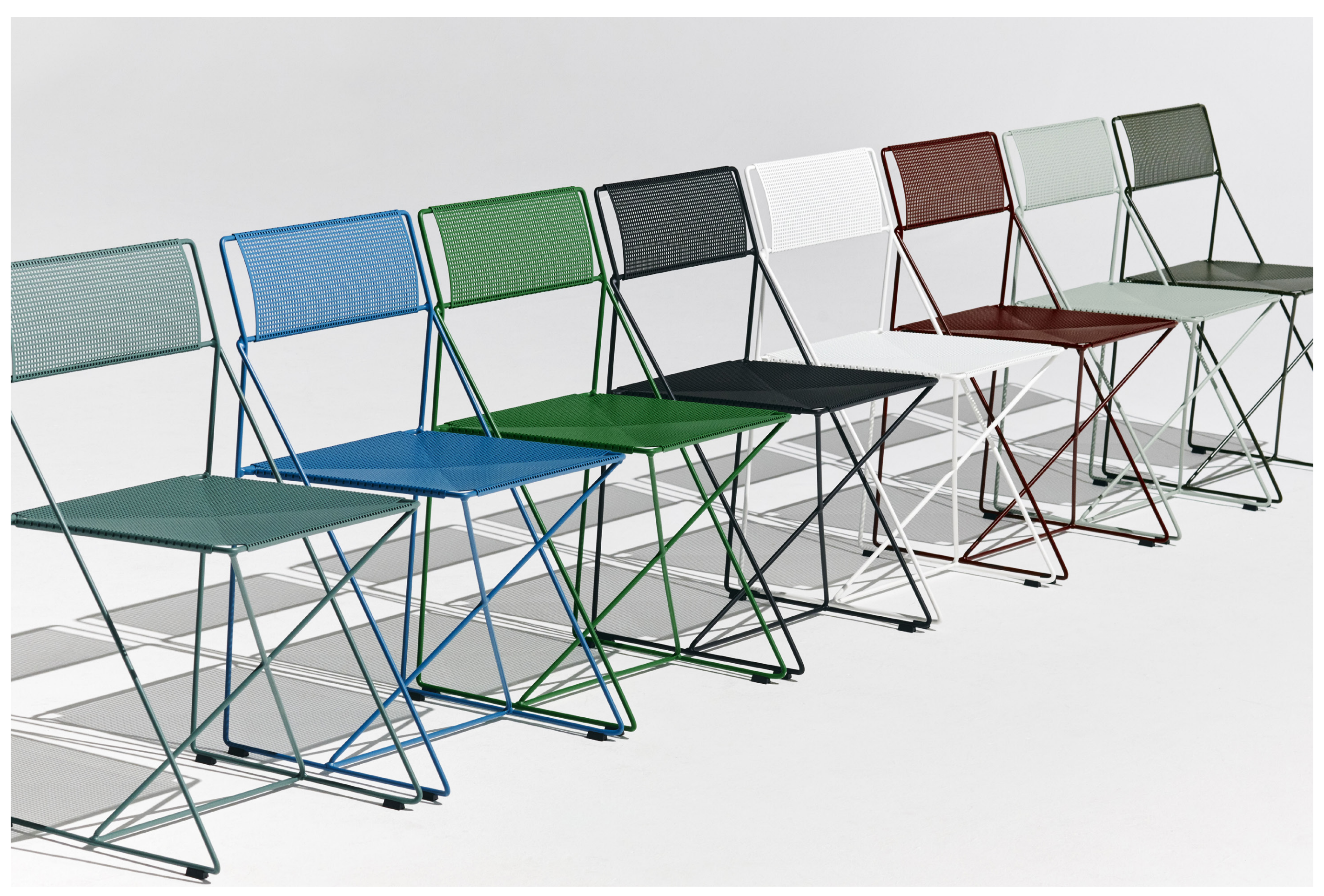
X-Line Chair Collection